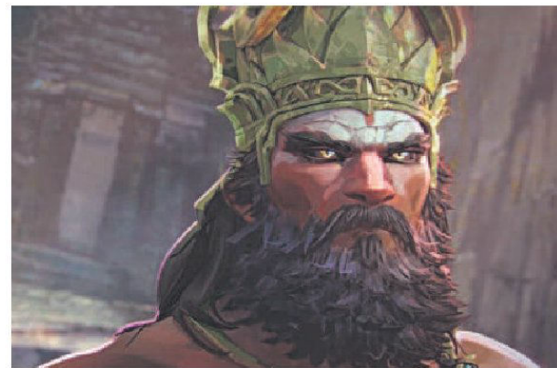
AI adoption in animation, visual effects, gaming and comics is rising, as studios embed it to cut costs and speed up production.